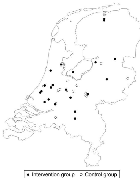
Figure 2 The ADAPT study locations in the Netherlands. Abbreviation: ADAPT, ADolescent Adherence Patient Tool.

of follow-up. 27 To detect a relevant difference ( >1.5 \pm 4.0 ) in MARS scores with a power of 80%, a significance level of 95%, and accounting for 35% dropout, 151 patients per group (intervention and control) are required. As a cluster randomized design is used, a correction factor of 1.16 is needed, based on inclusion of 10 patients and variation of 0.25 per pharmacy. This results in a sample size of 175.2 patients per group; thus, a total of 352 patients have to be included. Based on previous experiences, we estimate that ~25–30 patients per pharmacy will meet the inclusion criteria; therefore, inclusion of 10 patients per pharmacy should be feasible.